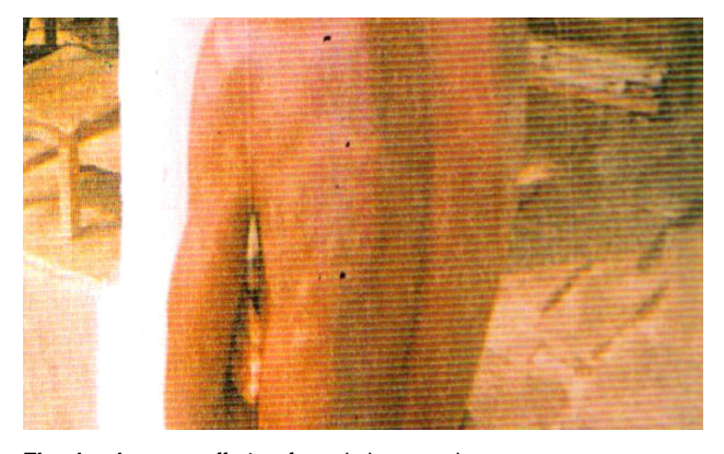
Fig. 1 : A man suffering fungal dermatophytes

ditions, habit and habitats, and his customs accounts for the fungal invasion. The tight bearing dhoti of loin cloth worn by men and women with tight-fitting in waist, the chemical fertilizers, pesticides, in paddy fields, and synthetic detergents, used in house job are the conditions imposing fungal infection in waist, foot and hand. The poor farmers, painters, barbers, house wives, in contact with solvents and caustic chemical products often suffer with dermatitis. The cattle breeders, cleaning employees, building construction and mining work-