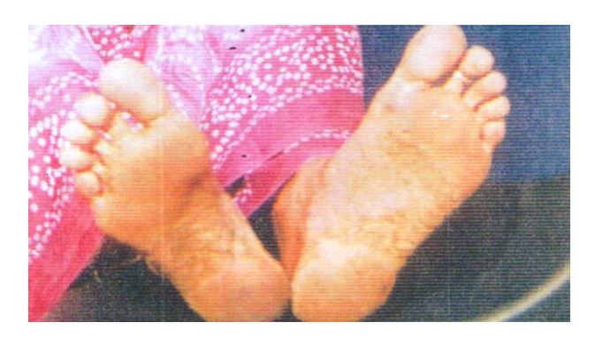
Fig. 3 : Women suffering from Tinea pedis