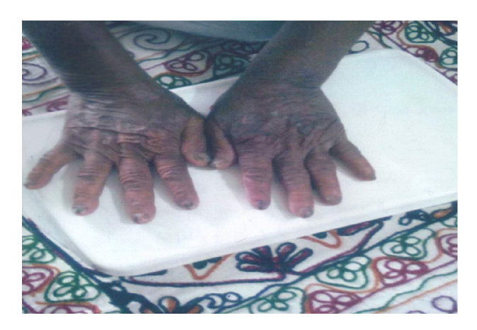
Fig. 2 : Farmer with thickened, discolored fingernails